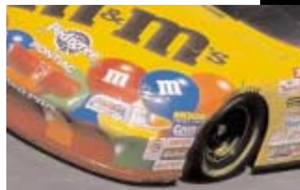
TEAM SPIRIT: UAW-GM award winners and ambassadors enjoy an amazing race weekend in Charlotte.