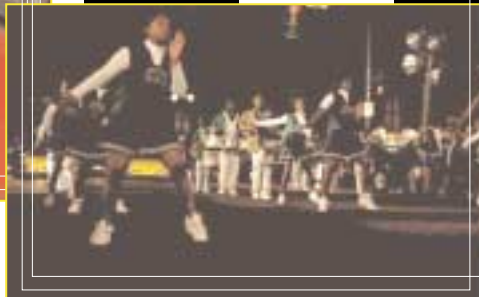
DAY TO REMEMBER: The UAW-GM Teamwork Parade in Charlotte, N.C., attracted thousands of race fans. From VIPs to cheerleaders and little beauty queens, parade-goers celebrated into the evening.