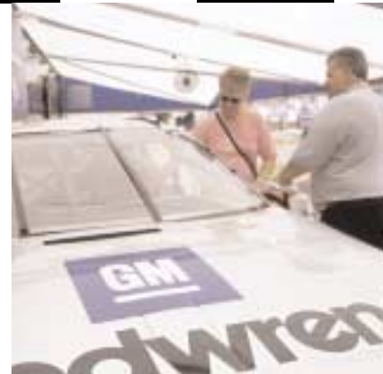
IN THE FAST LANE: Visitors to the UAW-GM Motorsports Exhibit can check the view from the driver's seat of a car from either Jeff Gordon's No. 24 or Kevin Harvick's No. 29 team.