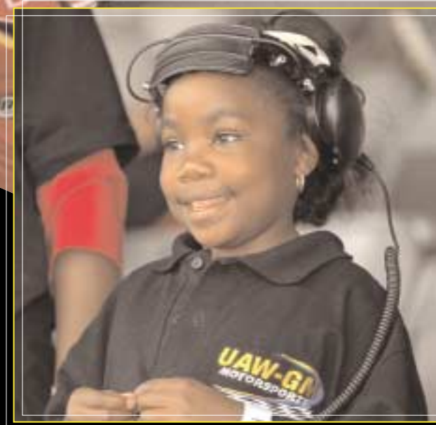
FROM ASSEMBLY LINE TO FINISH LINE: Much like a pit crew, UAW and GM people work together to create a race that millions of people across the country and the world will get to enjoy.